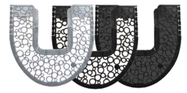
Keeps floors clean around toilets and urinals