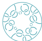
Easy Fresh Room air-freshener